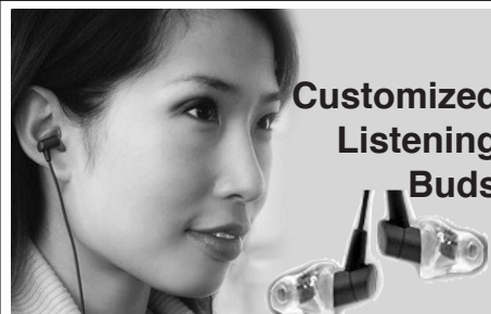
Customized Listening Buds

Everyone who listens to music through headphones appreciates the comfort, snug fit and exceptional quality sound that Etymotic customized earphones provide. If you have a REAL musician in your life, we also do customized musician plugs.