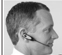
Custom Fit Blue Tooth