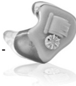
Electronic Shooters Protection - ESP

For the hunters in your family, this is a MUST-HAVE. Instant hearing protection is built right in with immediate response to a gunshot without compromising the hunting experience.